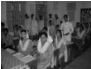
Home for Girls at Risk in Pakistan through the Presbyterian Education Board (PEB)